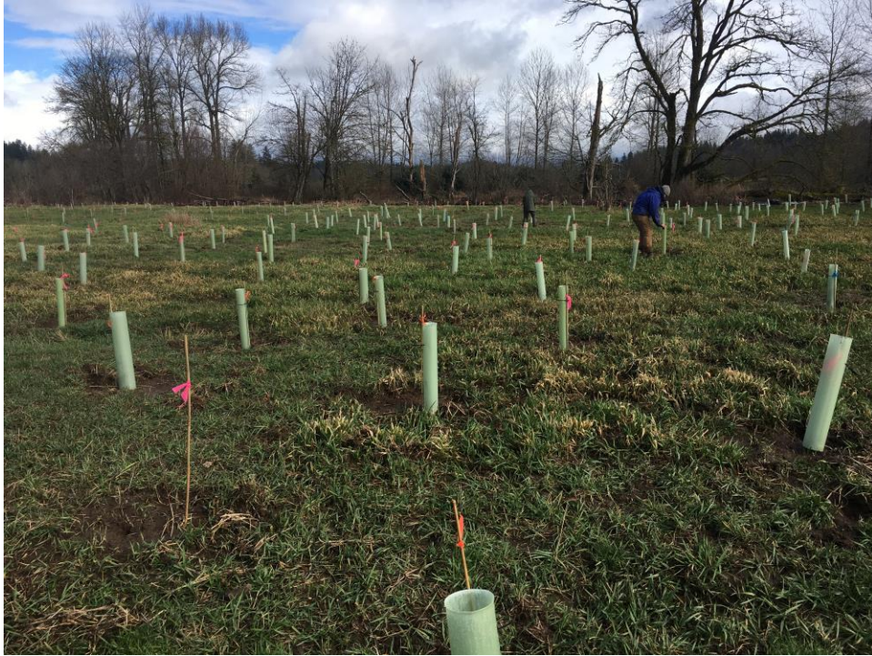
Photos (above and below): WA Conservation Corps members install tree protector tubes around the trees planted in the South Prairie Creek Preserve Interior Floodplain, February 24, 2021.