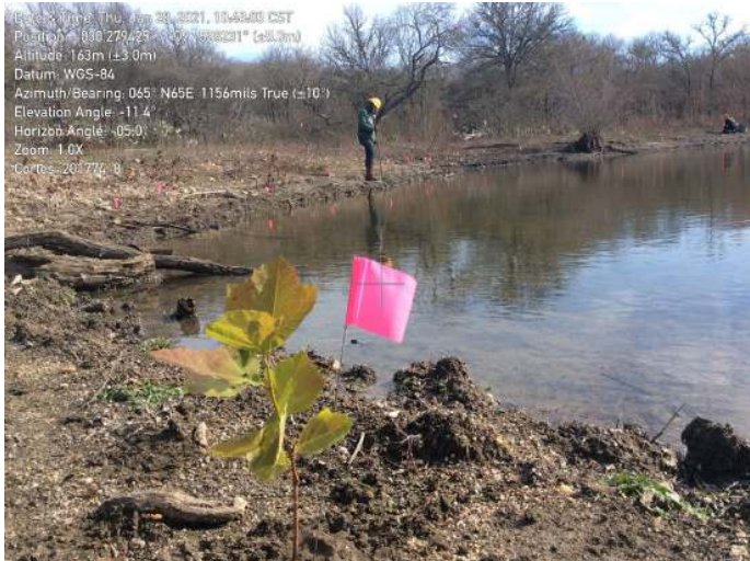
Photo Time: Thu, 20 Nov 2020, 10:48:00 CST Position: 030 270 23 37 988331" (sll.0m) Altitude: 163m (+3.0m) Datum: WGS-84 Azimuth/Bearing: 065; N65E 1156mils True (±10') Elevation Angle: -11.4' Horizon Angle: -05.0' Zoom: 1.0X Coords: 20 777 8