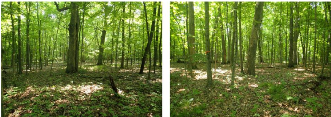
Figure 8. Areas of heavy sugar maple and American linden infestation at Reservation Woods – 6/1/18

This mesic woodland is suffering from a very heavy infestation of sugar maple and American linden (Figure 8). There are few large trees in this woodland and a flush of young, straight trees that have produced heavy shade have obviously changed the structure of this woodland since it was last surveyed in 1991. Despite some of these problems, there were few invasive species in this woodland and their numbers were rather low.