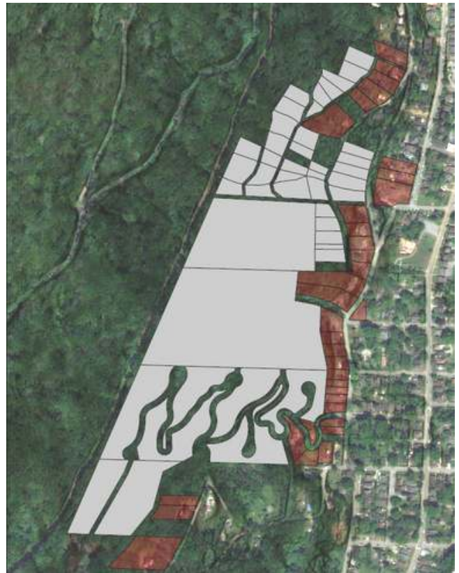
St Elmo Forest

community members and foundations who had helped purchase the property. LMC had conversations with supporters to secure buy-in, emphasizing that the funds raised would be re-invested in land stewardship and conservation.