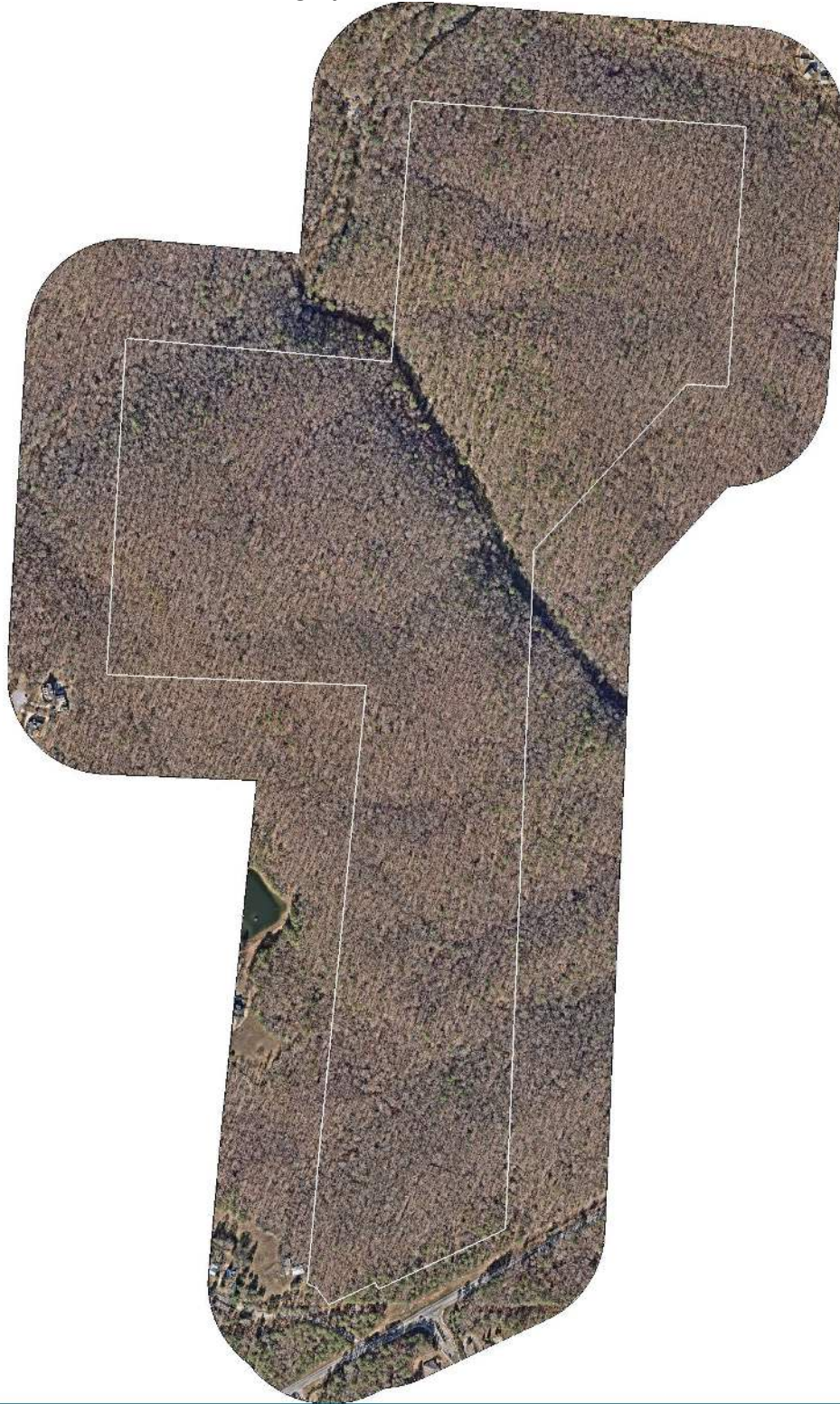
Exhibit A: 1/12/2026 Aerial Imagery