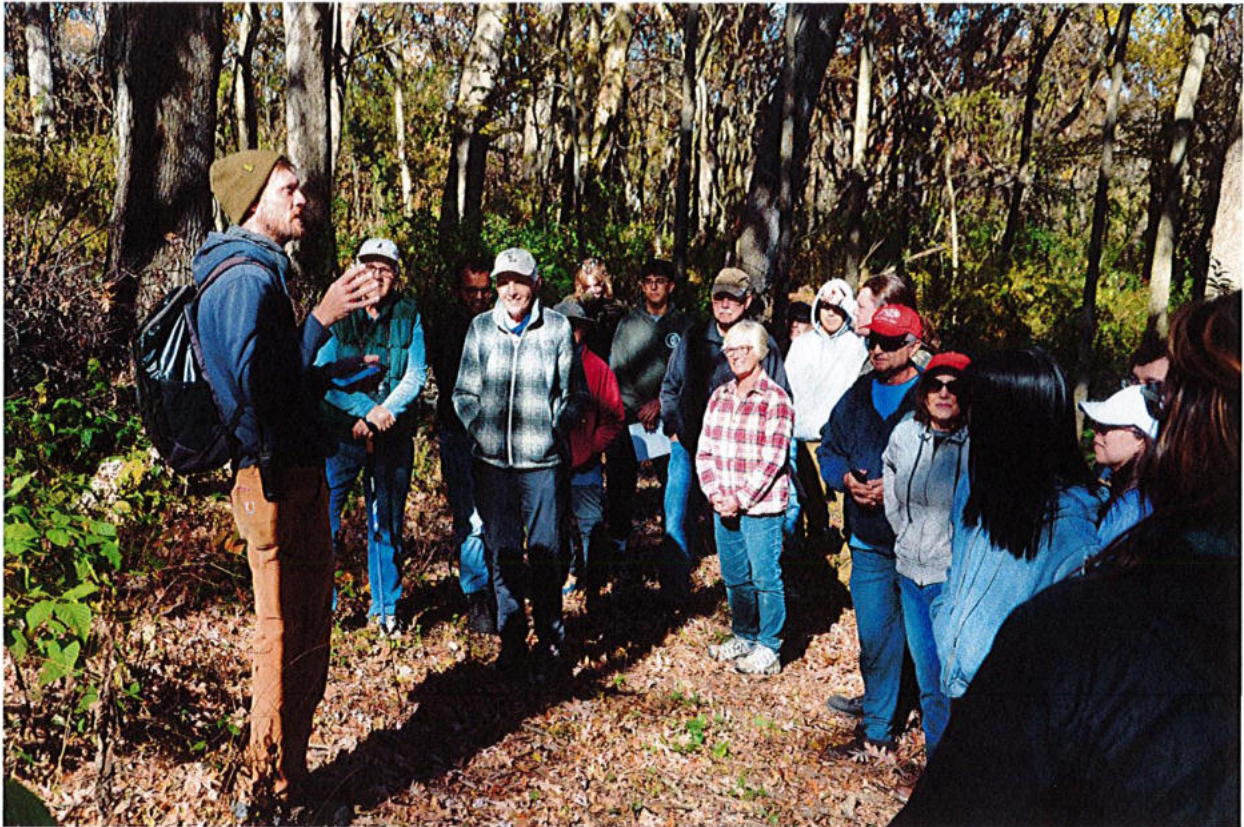
OAKtober hike at Lind-McGeachie Preserve, October 26, 2024

8. Please provide a photo of staff in, or the public using, the forest. (This is optional.)