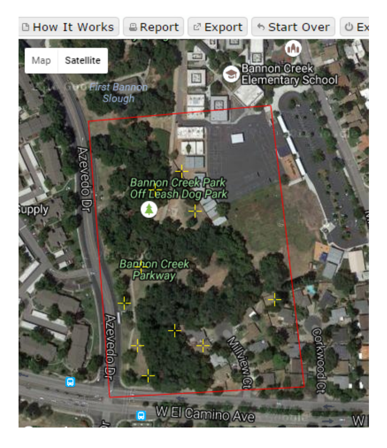
Figure 1. The Project Area where 500 trees were planted 25-years ago in Sacramento, CA.

The 500 trees were planted 25-years ago along the Bannon Creek Parkway bordered by Azevedo Dr. (west), Bannon Creek Elementary School (north and east) and West El Camino Ave. (south) (Figure 1). The Project Area, shown outlined in red using a Google image in the i-Tree Canopy application, covers 12.5 acres (5.1 ha). The numbers of trees originally planted are shown by species and tree-type in Table 1.