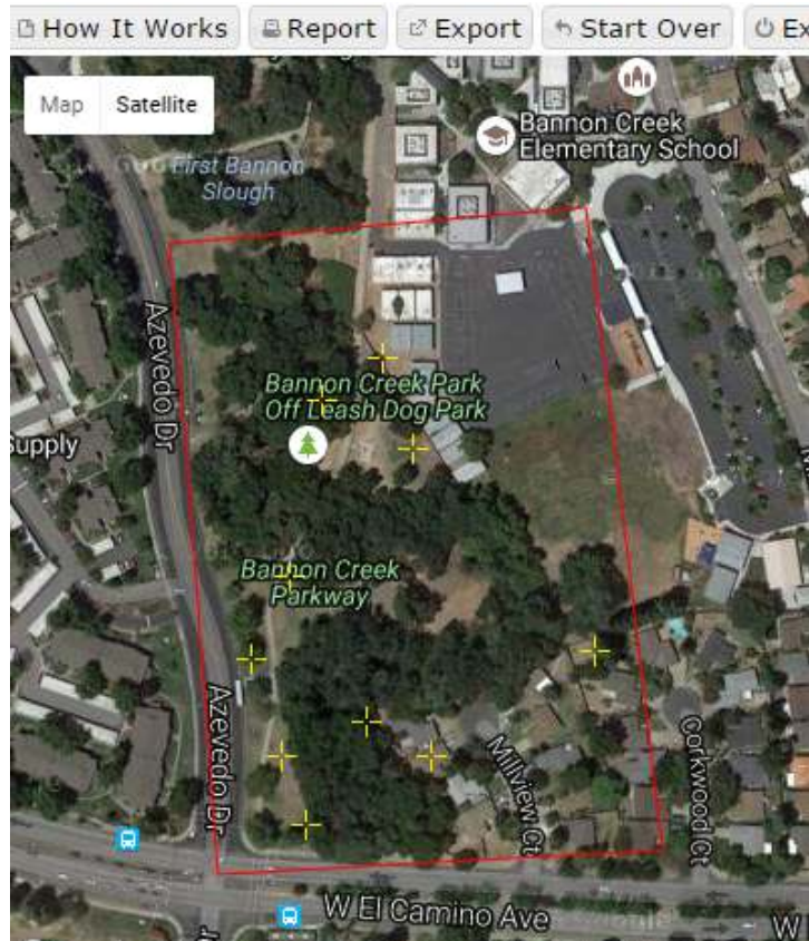
Figure 1. The Project Area where 500 trees were planted 25-years ago in Sacramento, CA.